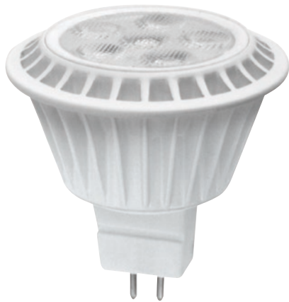
7W 12V MR16